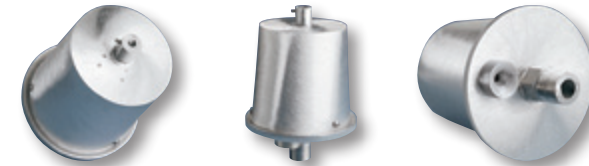
For Cable Style Internal Halyard Poles Threaded • Revolving • Single Pulley