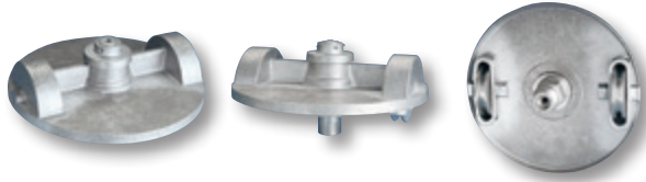
For External Halyard Poles • Threaded • Revolving • Double Pulley