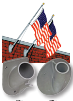
45° 30° BRACKET BRACKET